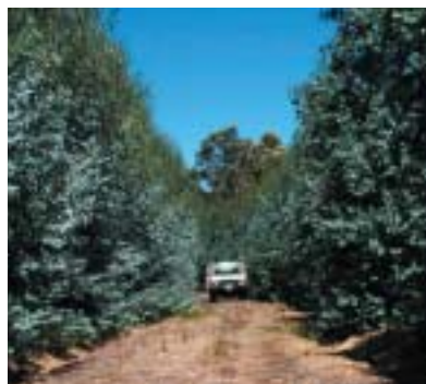
Planting site for clone sapling in Collie, Western Australia (as of March 2003, one year and eight months after planting)