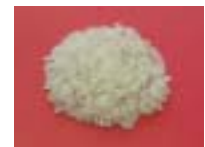
Ordinary rice (polished rice)

Rice with health-promoting benefits (genetically modified[*20] rice including a large amount of GLP-1, the peptide drug that promotes insulin secretion)