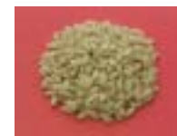
Rice including GLP-1 (unpolished rice)