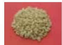
Ordinary rice (unpolished rice)