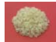
Rice including GLP-1 (polished rice)